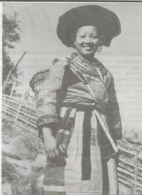
Pray for the Pathen

The Pathen are a colorful, friendly people group, but few have ever had the opportunity of hearing that Christ died for their sins. In Vietnam and China they remain a completely unreached people group without a single known believer. Unfortunately, no Scriptures or Gospel recordings exist in their mother tongue.